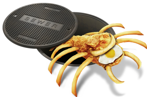
"Chicken Spider" courtesy of GBF's Cease the Grease

You'll be hearing more from us about "Cease the Grease" as implementation continues. In the meantime, remember: Cease the Grease in the Double Bayou watershed!